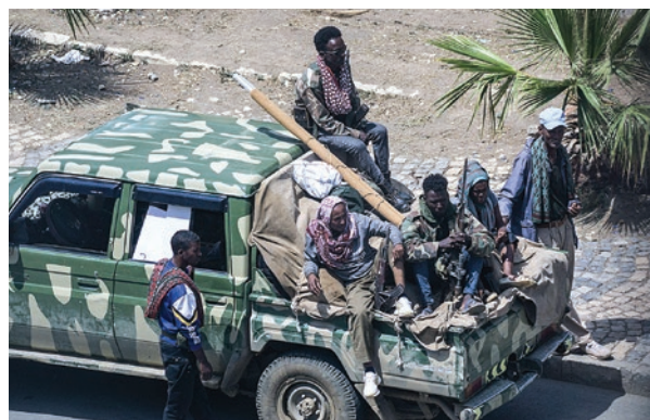
TPLF Soldiers on the streets of Mekele City, Tigray Region, Ethiopia, July 2021.

northern Ethiopia, between regional militia and federal forces assisted by neighboring Eritrea. Prime Minister Abiy Ahmed, once hailed as a champion of peace, was facing accusations of war crimes by his opponents and a probe by the international community. 4 Between June and November 2021, the Tigray Peoples’ Liberation Front regained control of the Tigray region and captured different cities while advancing militarily on Addis Ababa. In November 2021, the government issued a nationwide state of emergency. As a result, Western nations downsized their embassies and many international development organizations temporarily sent their personnel out of the country. The new prime minister, whose popularity was once compared to that of a savior, now had many critics who had either been sidelined or imprisoned or were in exile. 5