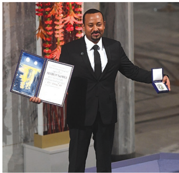
Ethiopian Prime Minister Abiy Ahmed Ali receives the Nobel Peace Prize in Oslo, Norway, December 2019

The governments of Sweden and Denmark fund media reform in Ethiopia through projects jointly implemented by Fojo Media Institute and IMS. This support avails $4 million for three years beginning in 2020 to boost citizen access to information and community engagement in the country's governance through capacity-building efforts that produce high-quality public interest journalism inclusive of women and marginalized communities. This project supports Ethiopian media organizations in partnership with the association for editors, community broadcasters, journalism schools, and media think tanks. This project also supports the